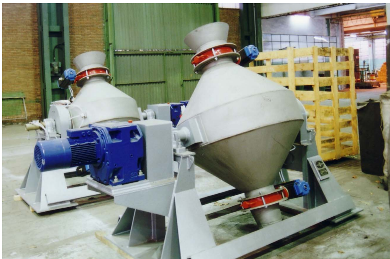
Biconical Mixers MBD 500, in stainless steel

This type of mixer is designed for discontinuous processes, controlled either automatically or manually.