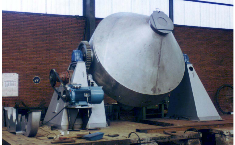
Biconical Mixer MBC 10.000, with 10.000 l of capacity.

By modifying the rotation speed of the machine can achieve different degrees of homogenization.